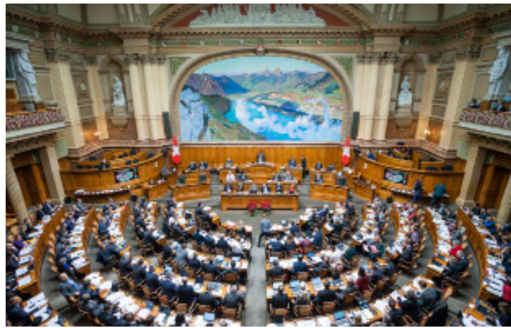
the Swiss Parliament, Bern

Federal Assembly inside Snow-shoeing, a typical Swiss winter sport in the moutains