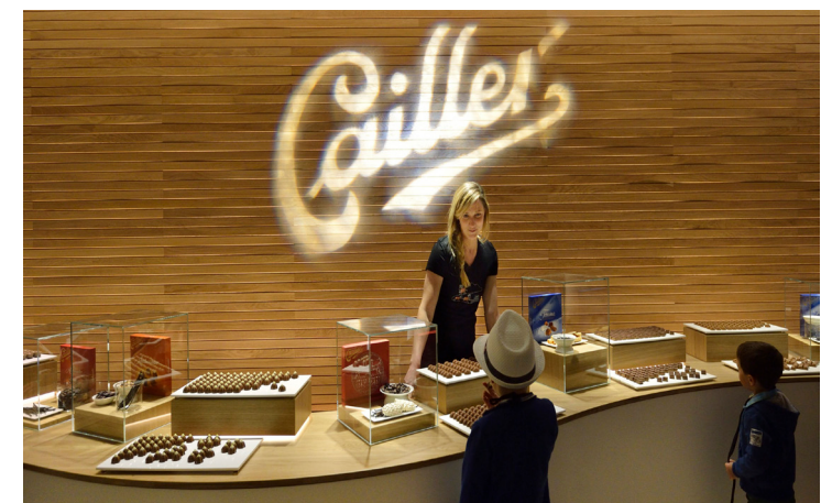
Tasting room in the Cailler Chocolate Factory, Fribourg

The ceiling of the Palais des Nations, in the United Nation Office in Geneva